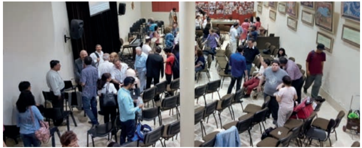
Derej Haemuna Messianic Center in Buenos Aires