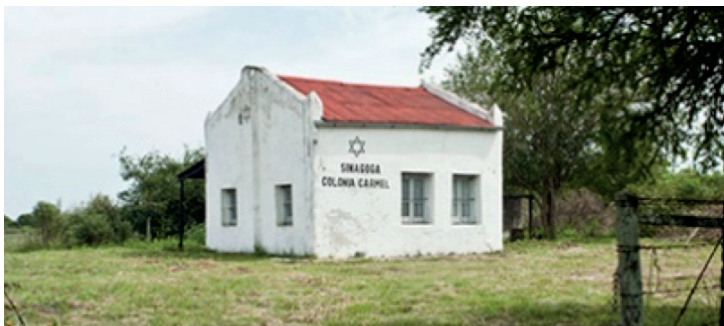
Small synagogue in the Argentine countryside