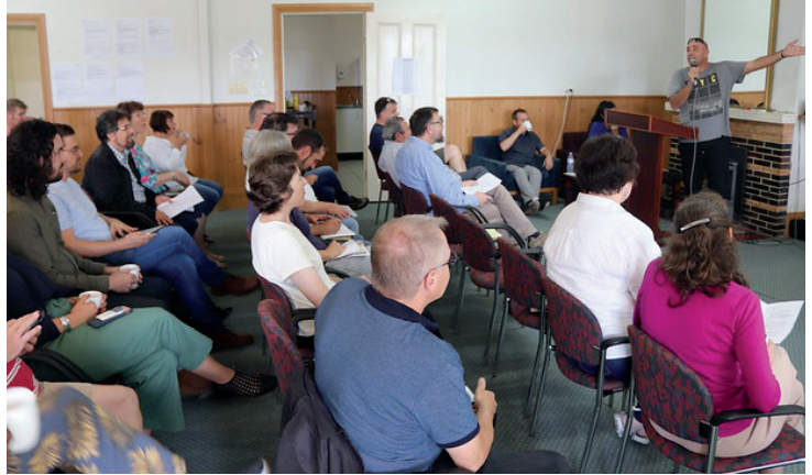
LCJE Australasia Conference - Melbourne (Belgrave Heights)

ters are in Melbourne in the heart of the largest Jewish community in Australia, in what is known as the Melbourne Eruv. In this environment there are about 75,000 Jewish people with approximately 45 synagogues, Jewish schools and organisations, kosher restaurants etc.